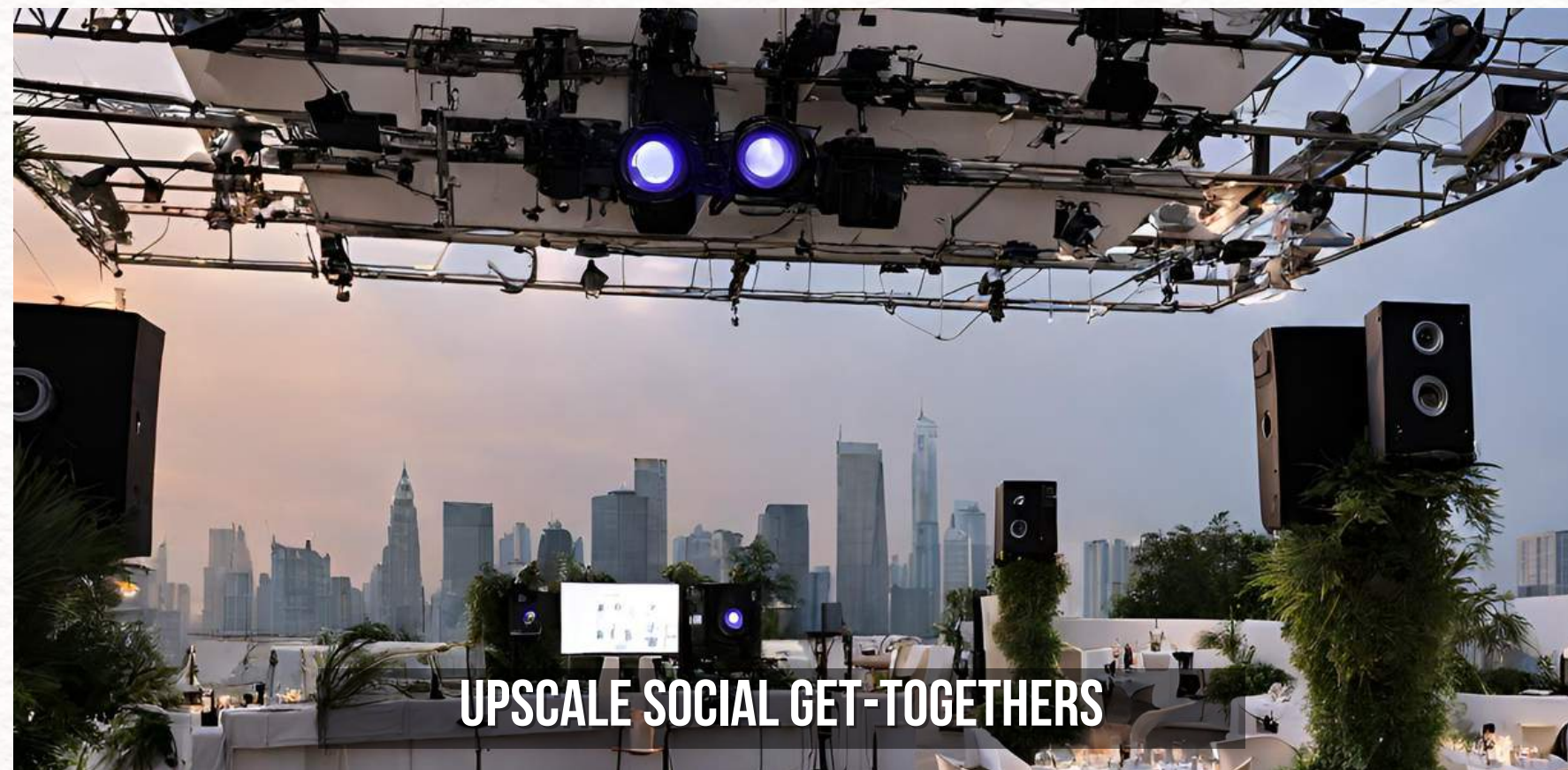
UPSCALE SOCIAL GET-TOGETHERS